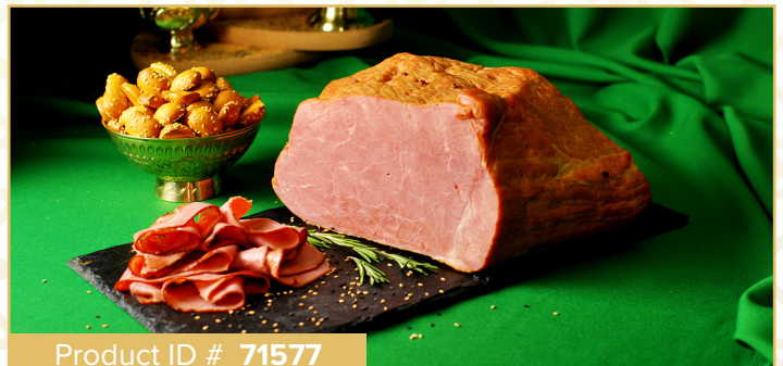
Product ID # 71577