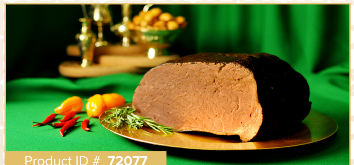
Product ID # 72077