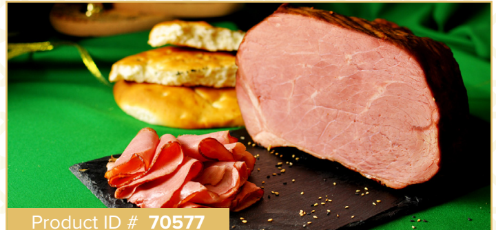
Product ID # 70577